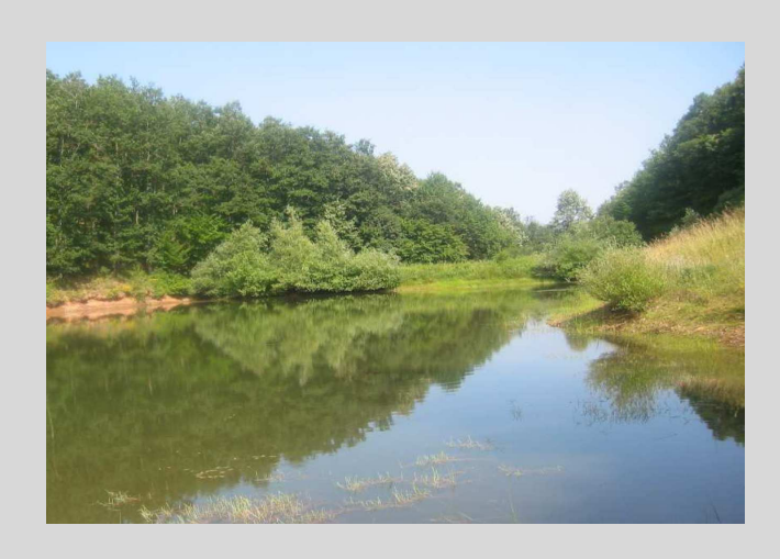
Austria in Cooperation with Finland and Latvia